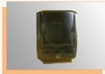
Auto Roll Paper Towel Dispensers