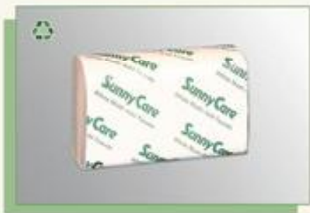
Bleach White Multi-fold Paper Hand Towels