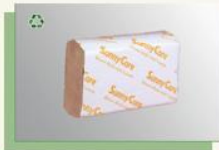
Natural Multi-fold Paper Hand Towels