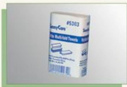
White Premium Multi-fold Paper Hand Towels