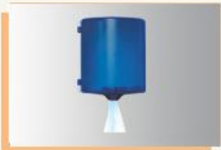
Center-Pull Hand Towel Dispensers