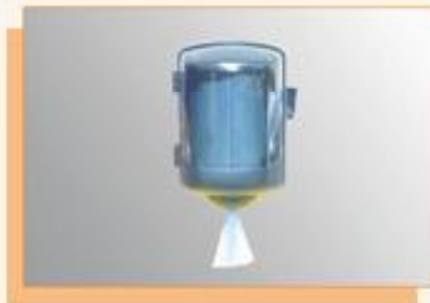
Center-Pull Hand Towel Dispensers