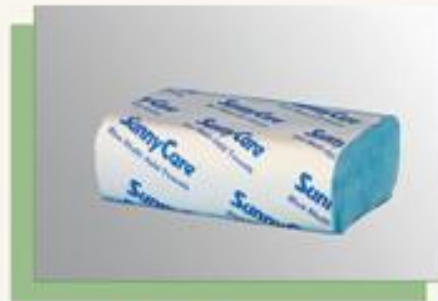
Blue Multi-fold Paper Hand Towels