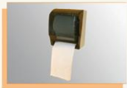
Lever Roll Paper Towel Dispensers